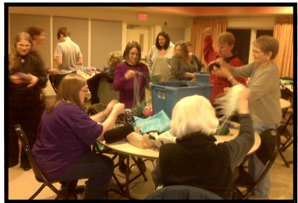
Conscientious Knitters pitch in to sort and wind the yarn stash used for social justice projects.