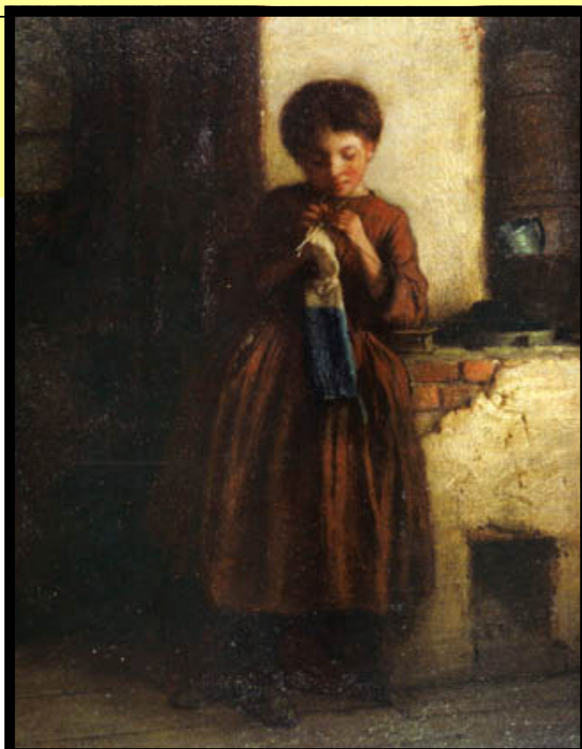
Knitting for Soldiers Eastman Johnson, 1861